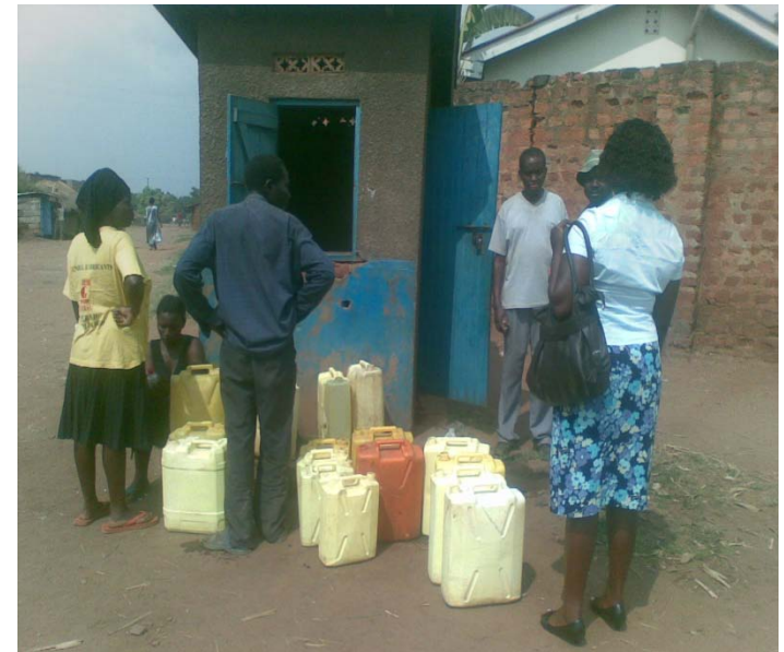
PLATE 2: COLLECTING WATER AT A WATER STAND POINT IN NAMBOZO

As far as management of sewerage, in Nambozo, people puse pit latrines and these are about 100 in the entire cell (cluster).